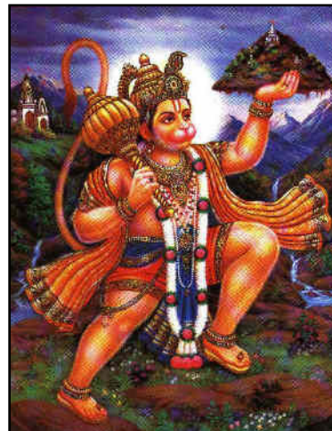
Hanuman the Monkey God