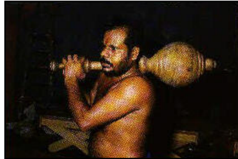
Kalari practitioner with large club

Within this short sequence of events we see two acts with the club: one the action of striking and one the action of throwing, (the act of beating down to the ground and the act of throwing up to the sky). David Latini suggests that the throwing of an object skyward may be one of the first ways of acknowledging the heavens and the possibility of a Creator.