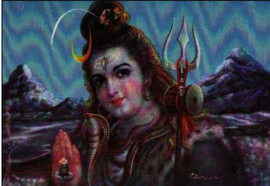
Shiva entwined by a snake carries his trident and drum. In his right hand is a female yoni penetrated by a male lingam giving birth to the flowering of life. From his head, his female aspect Shakti gives out a stream of water - the nourisher of life

In Pagan cultures the snake is often connected with female deities and the Earth Mother. Minoan statues of the Mother Goddess show her holding snakes in her hands, the Great Goddess Ishtar from Babylonia is often portrayed with a serpent, and Athena the Greek Goddess of Wisdom and War revered the snake. The Celts associated snakes with healing waters and wells.