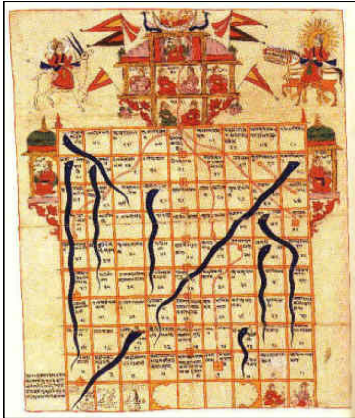
The Game of Life from Rajasthan 19 th Century (Victoria and Albert Museum)

The snakes and ladders board game has its roots in the 'game of knowledge', most likely originating from India. The aim of the game is to ascend towards the highest states and avoid the hells at the bottom. The ladders represent good conduct and knowledge, while the snakes stand for ignorance and evil.