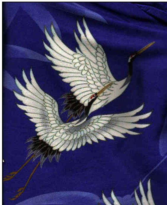
Cranes in flight—detail from silk gown

The crane's white feathers are seen as a symbol of purity and relate to the AIR element and the yang of the heavens. Their red head feathers are considered to be a sign of vitality and connect to the yang element of FIRE .